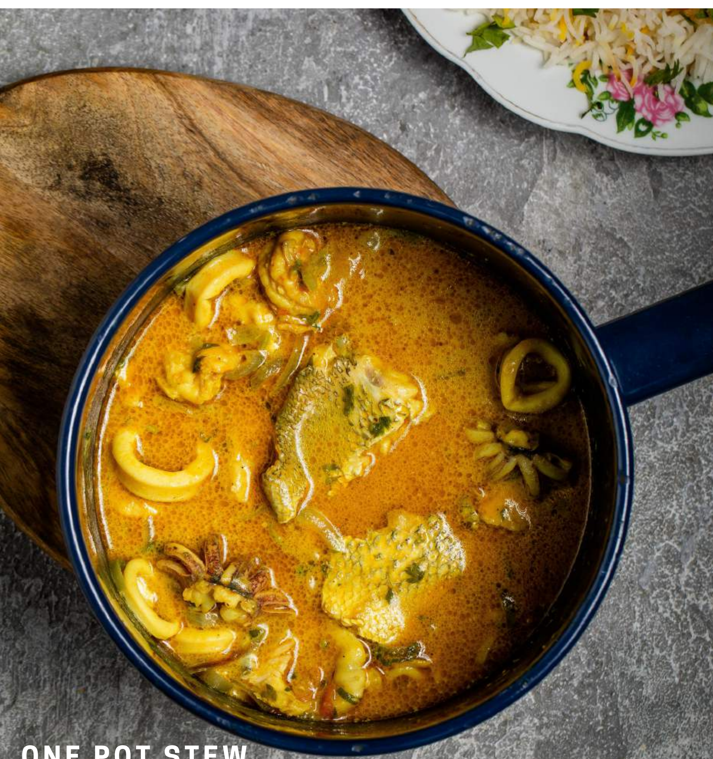
ONE POT STEW

seared sea bass with grilled tomato and onion served with side white rice, bread or fries