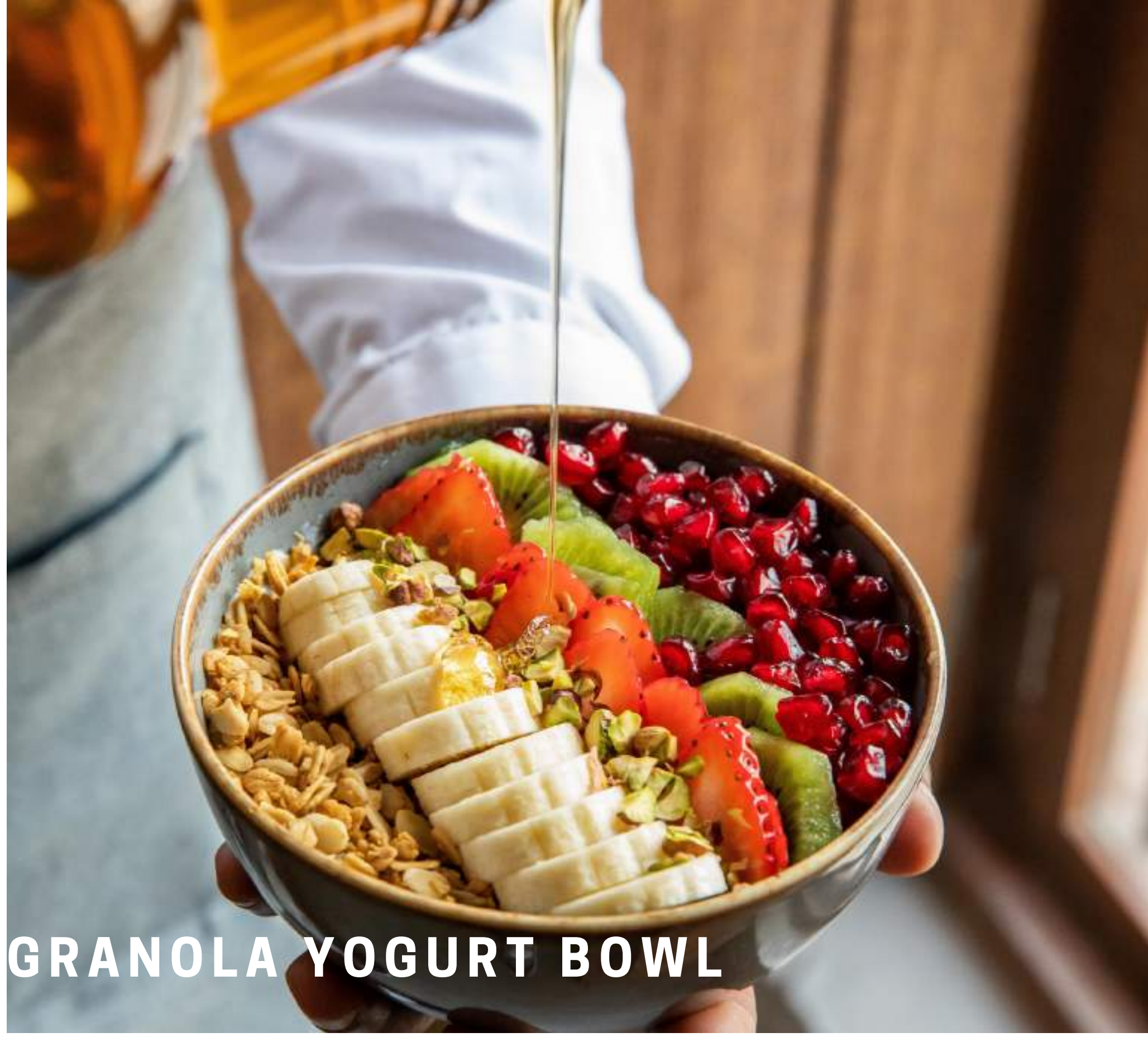
GRANOLA YOGURT BOWL