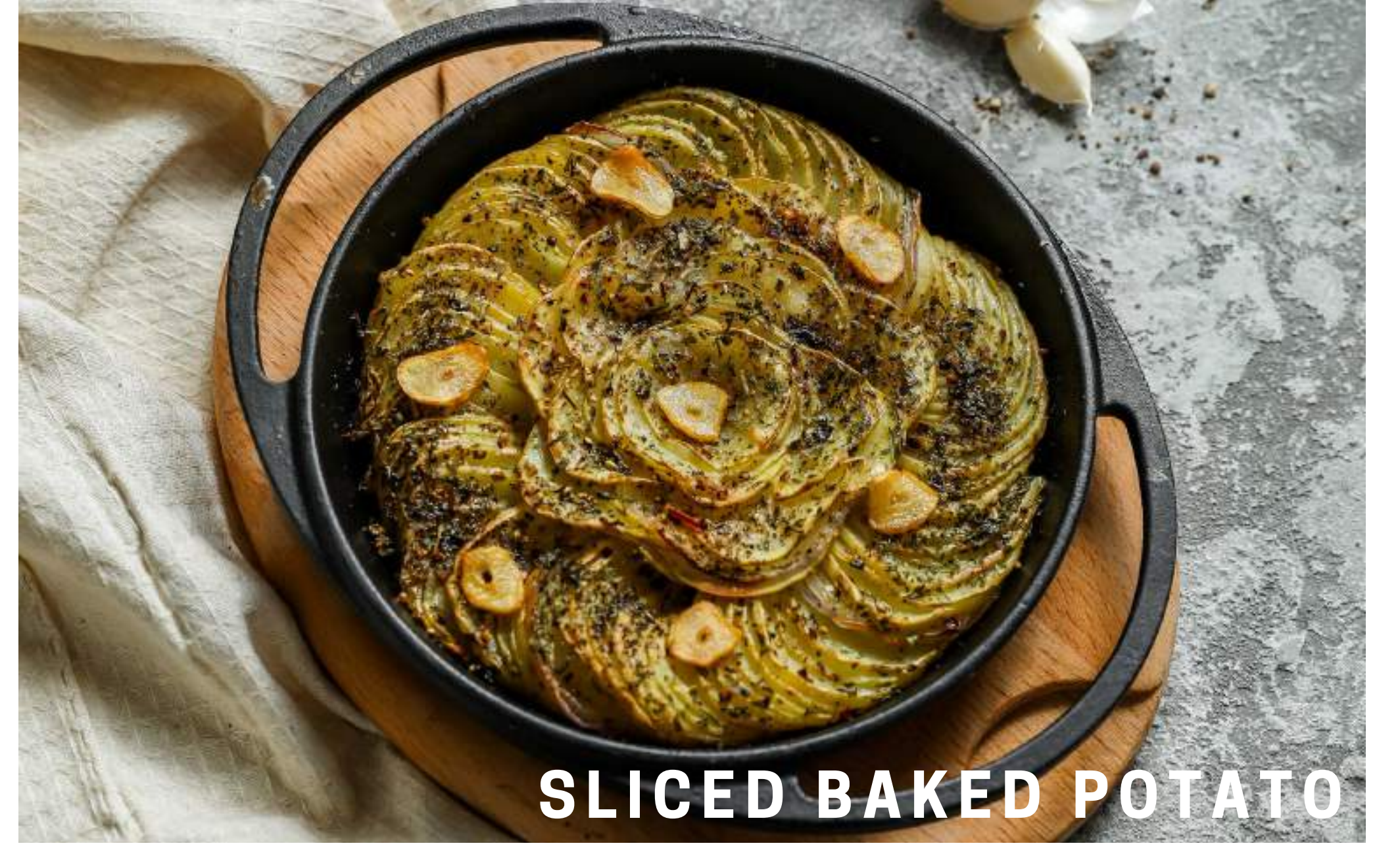
SLICED BAKED POTATO