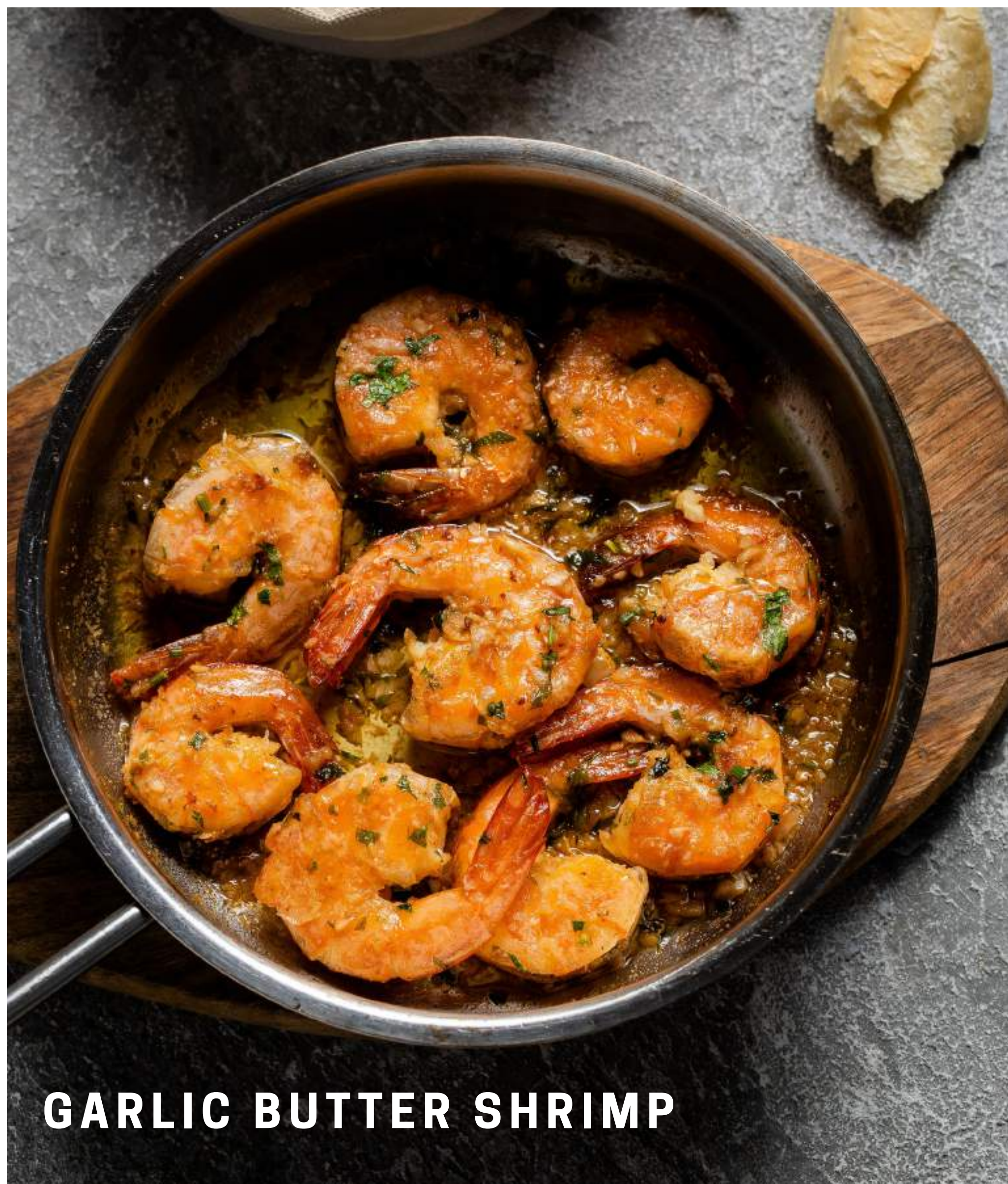
GARLIC BUTTER SHRIMP