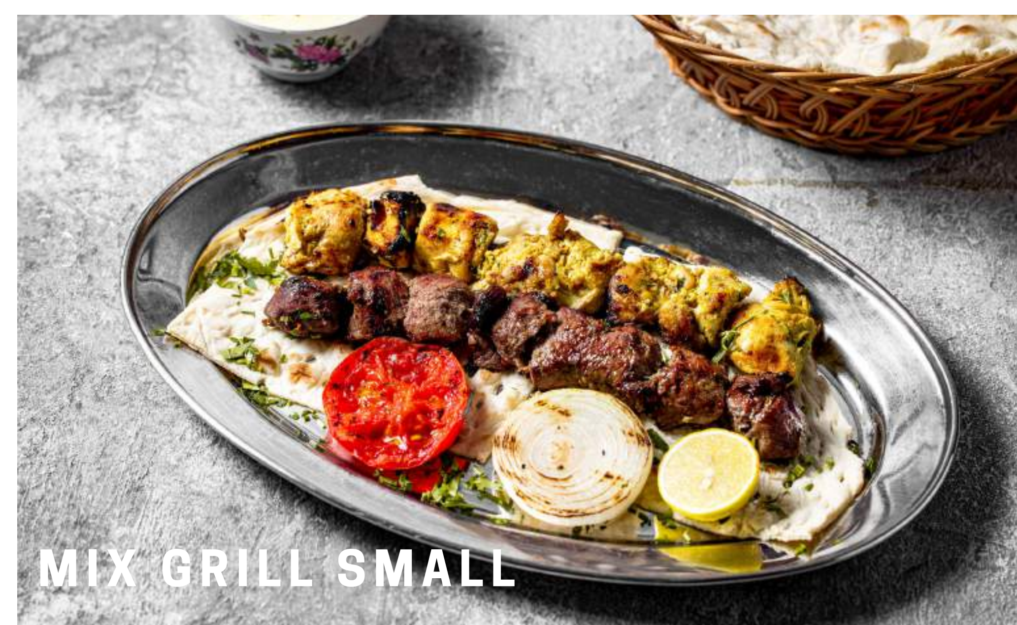
MIX GRILL SMALL