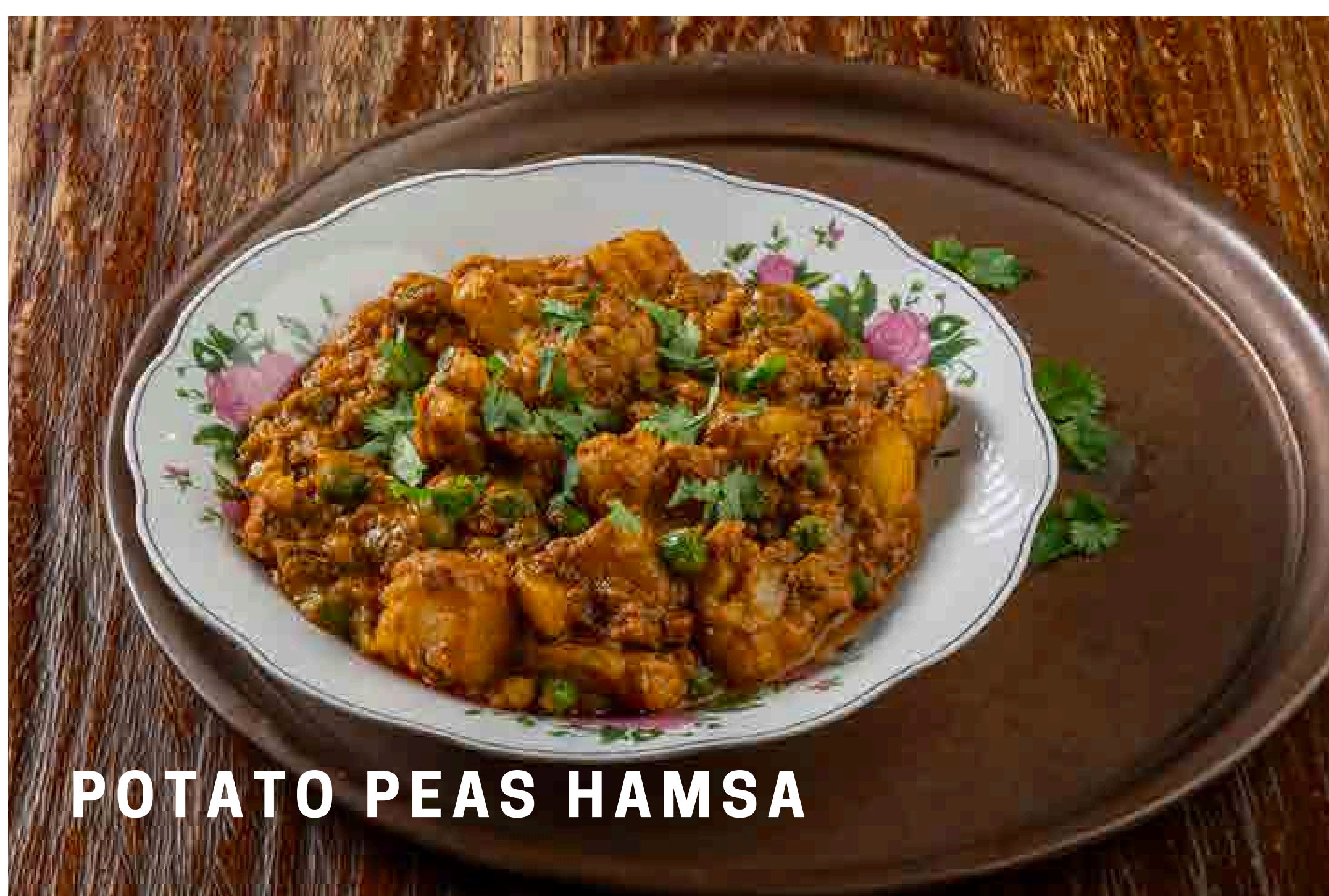
POTATO PEAS HAMSA