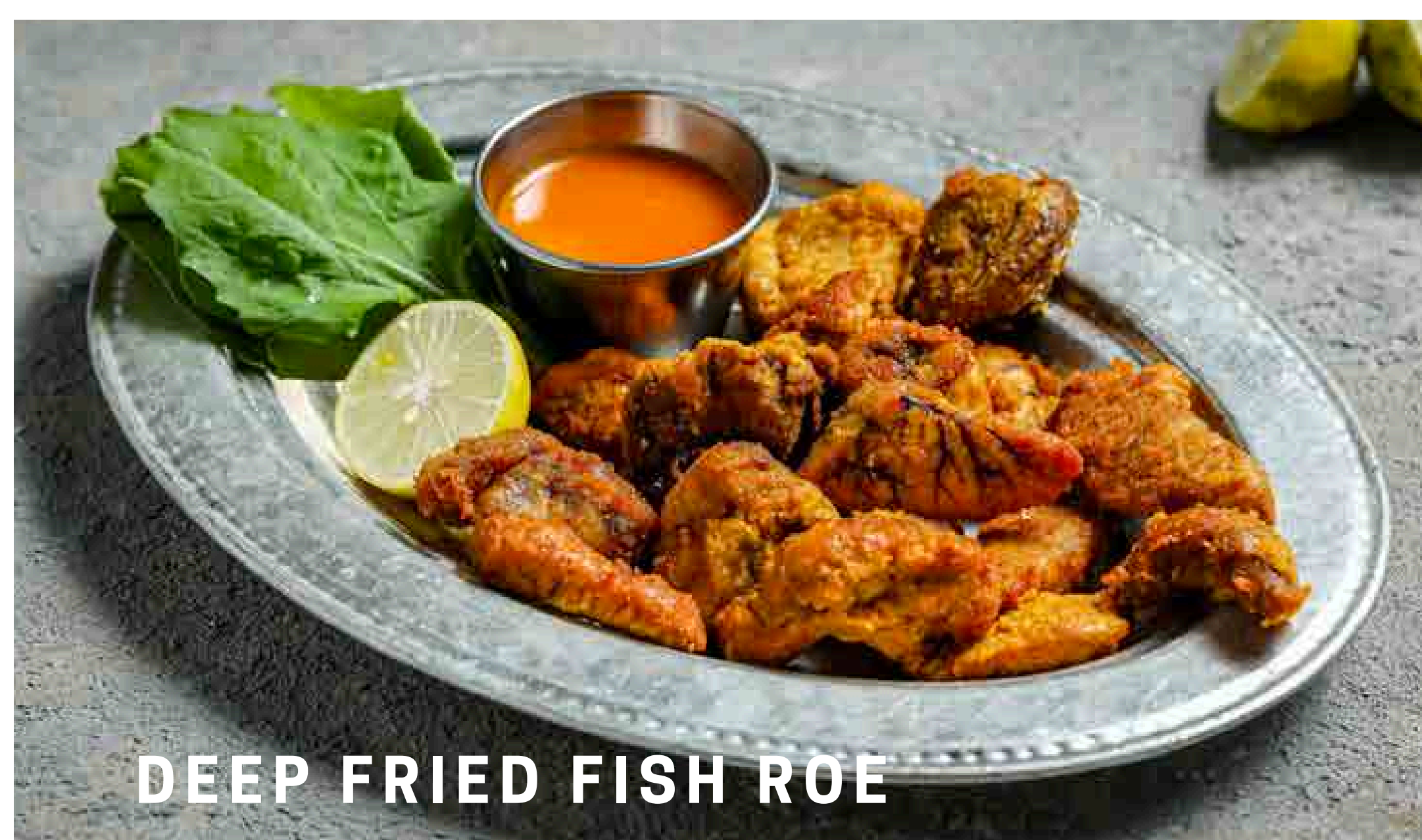
DEEP FRIED FISH ROE