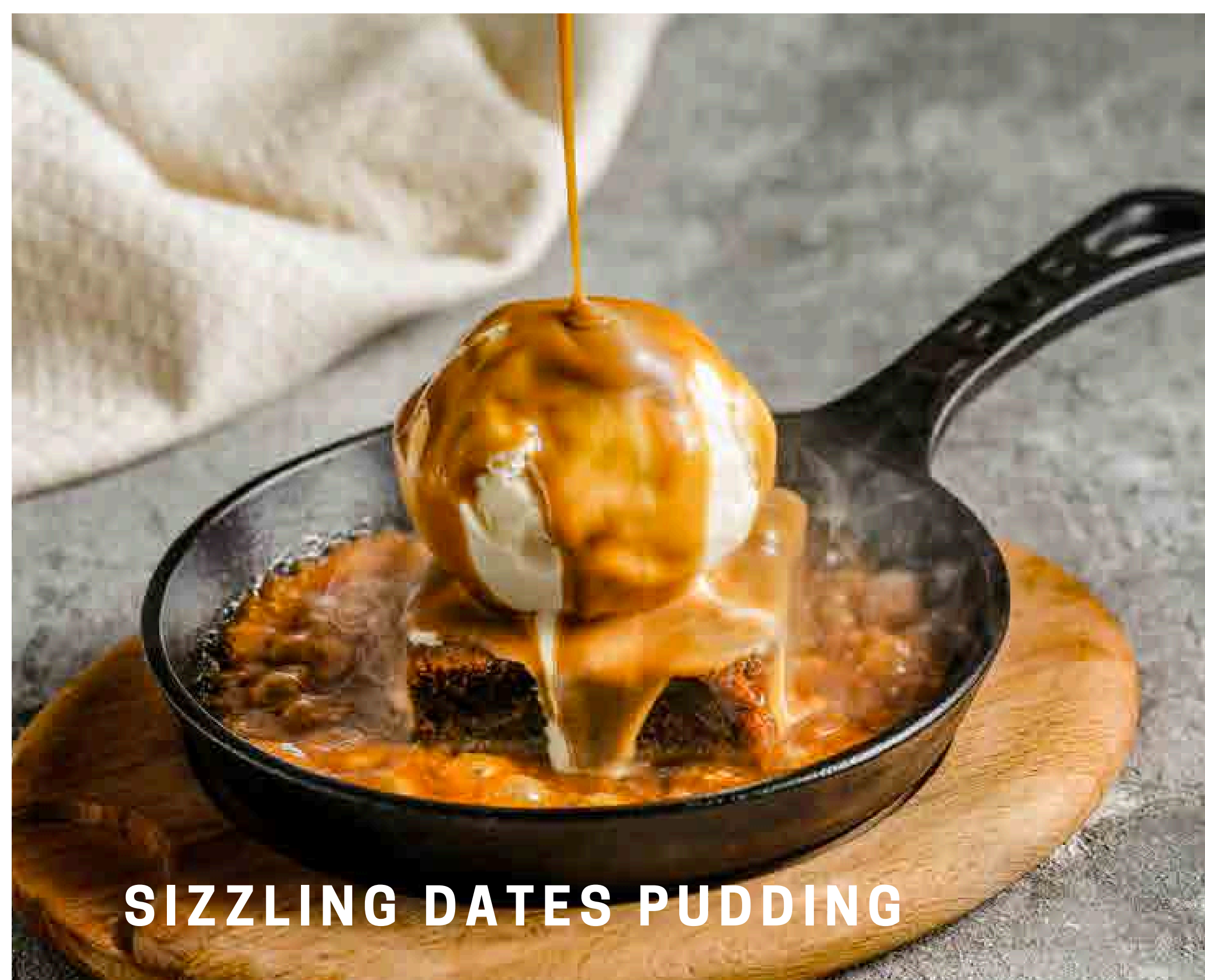
SIZZLING DATES PUDDING

Dates pudding with vanilla ice cream served in sizzling skillet