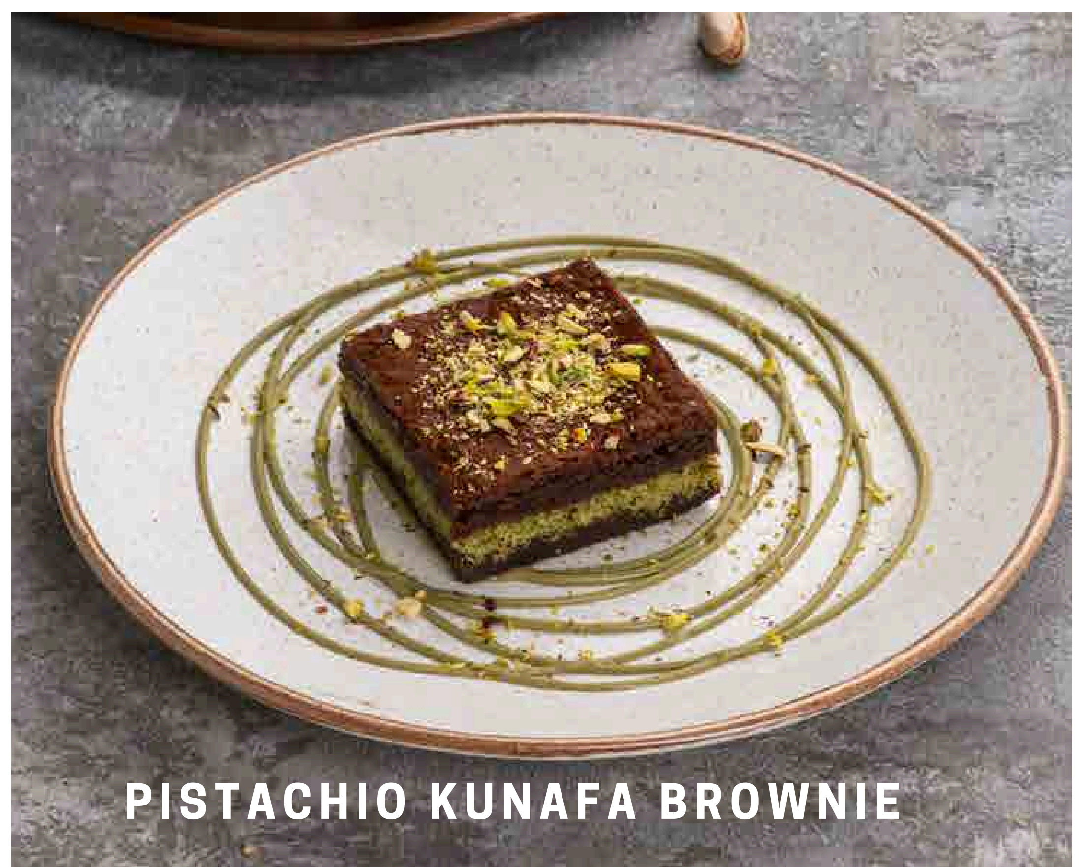
PISTACHIO KUNAF A BROWNIE

A rich, fudgy brownie layered with crunchy kunafa and velvety pistachio cream, finished with a dusting of pistachios.