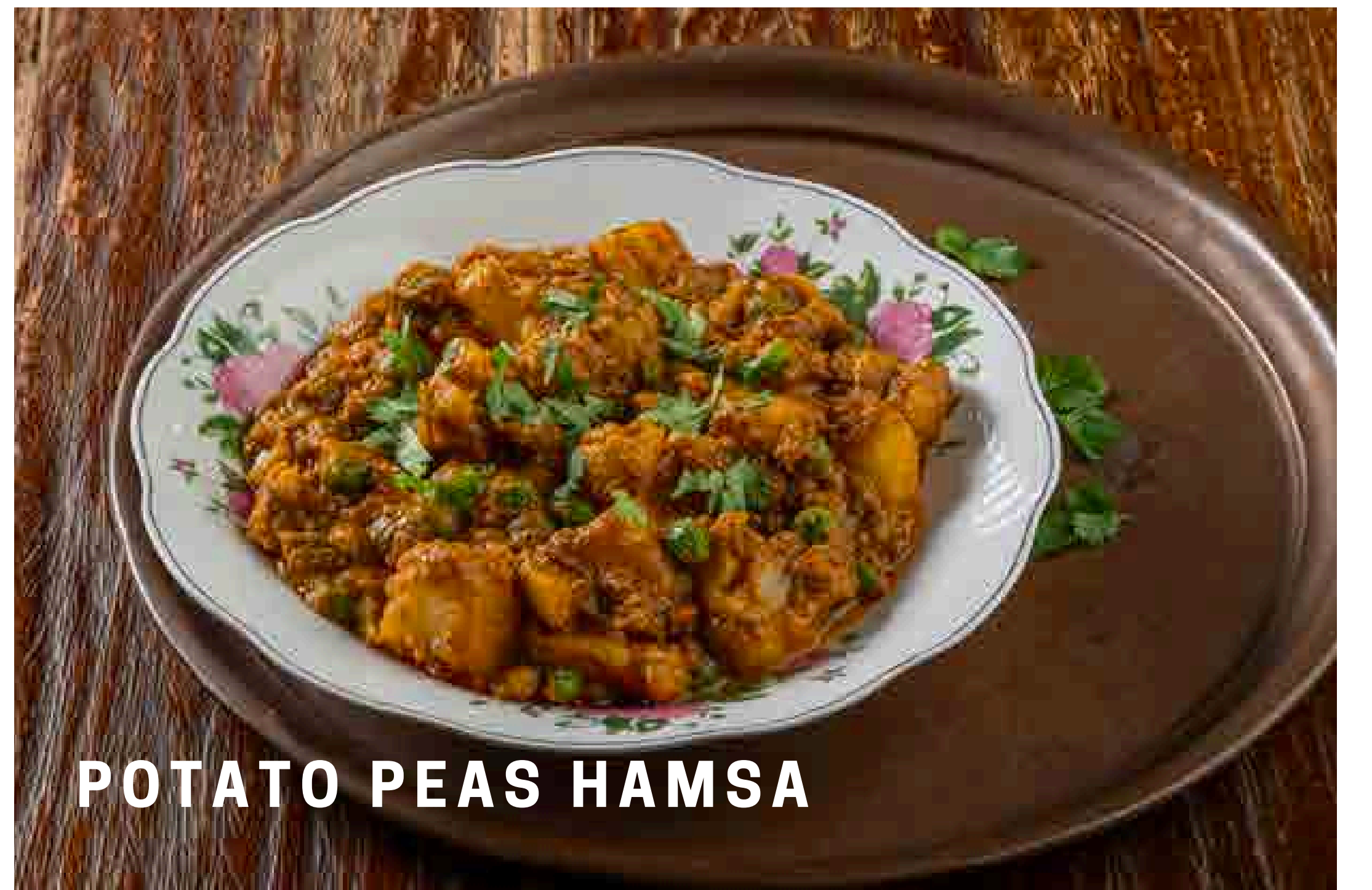
POTATO PEAS HAMSA