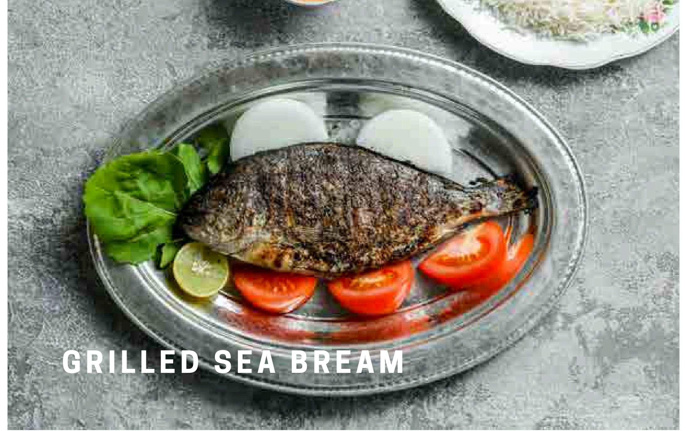
GRILLED SEA BREAM