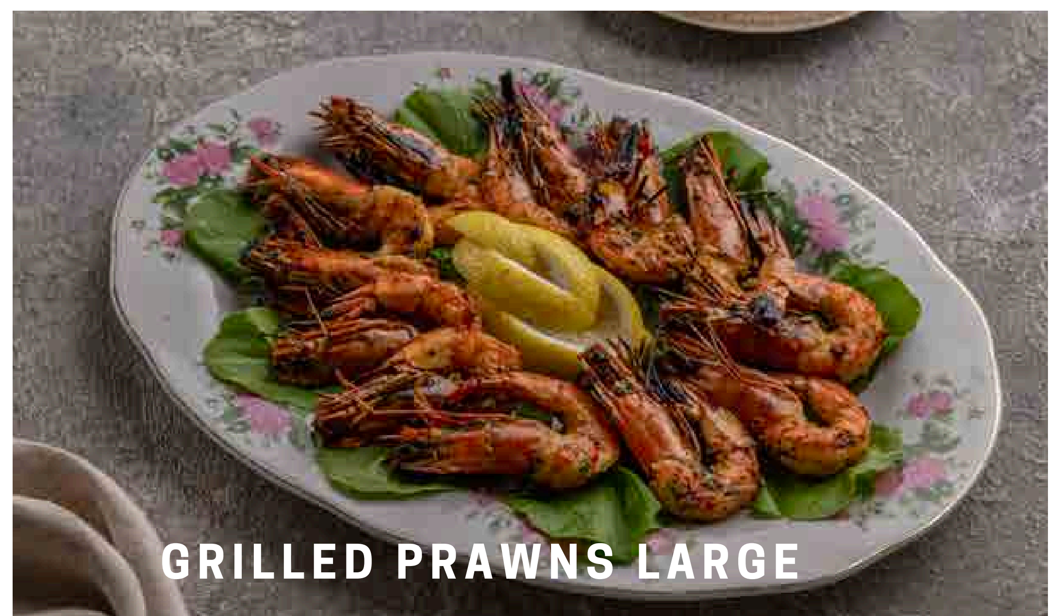
GRILLED PRAWNS LARGE