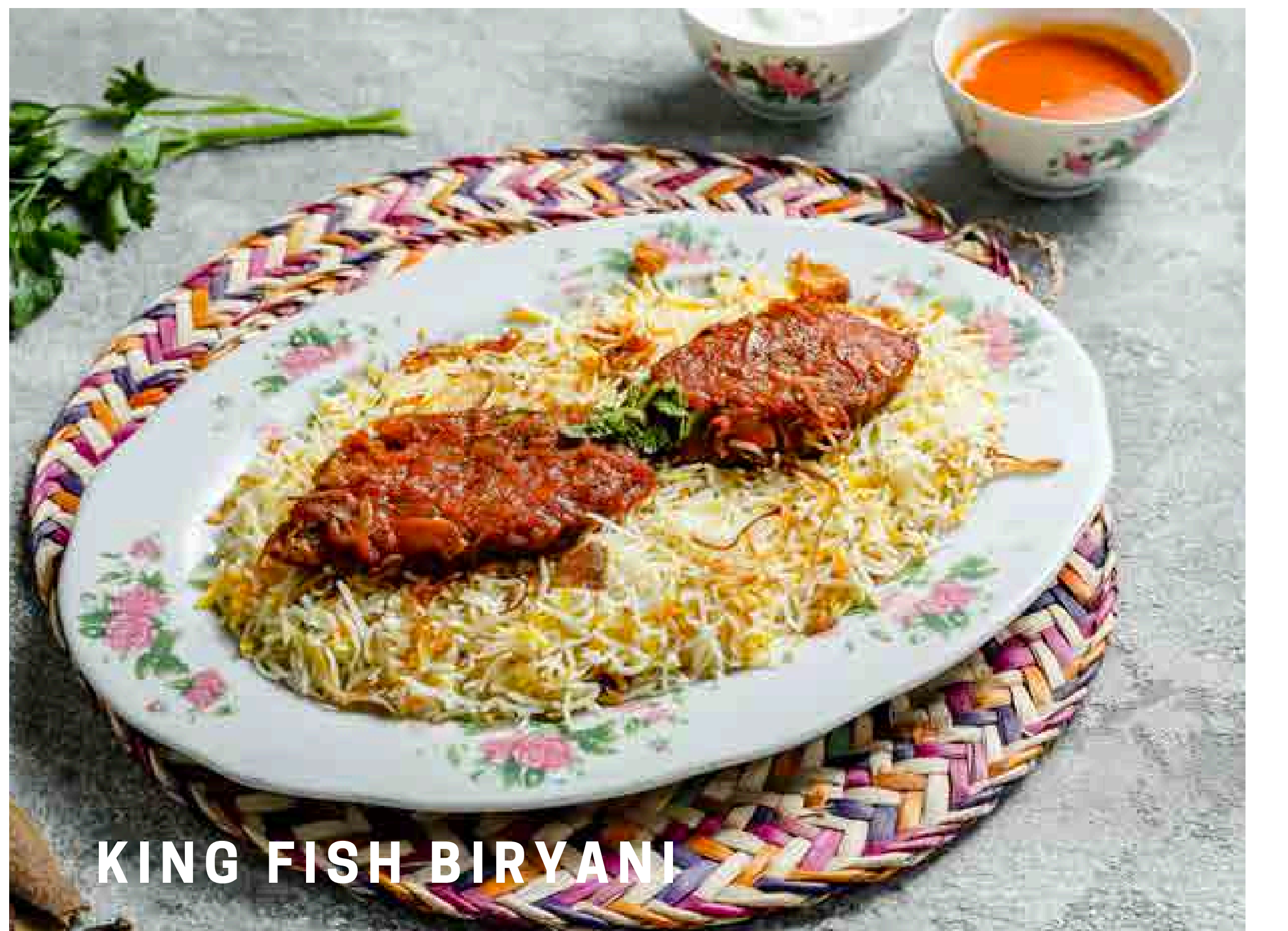
KING FISH BIRYANI